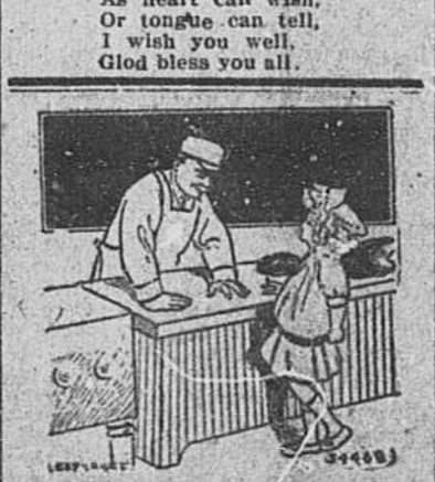
THE LITTLEST GIRL. That comes into this market with an order from her mother gets just as good meat as the mother would.

I wish you well. As heart can wish, Or tongue can tell, I wish you well. God bless you all.