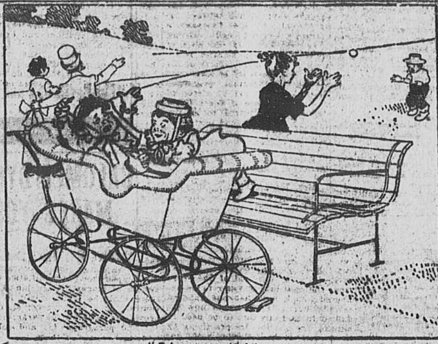
Baby wants a drink!