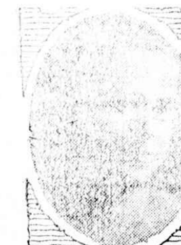
MISS DELL MONTGOMERY LAURENS CO.