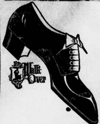
Style 2163. WALK-OVER.

The new pointed toe Oxford, made in Patent Leather, Gun Metal, Vici Kid and Russian Calf.