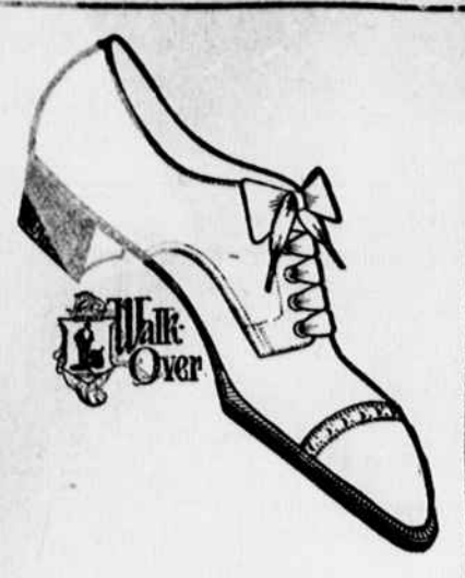
Style 2363 WALK-OVER.

The new pointed toe Oxford, made in Patent Leather, Gun Metal, Vici Kid and Russian Calf.