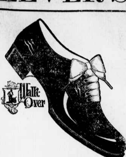
Style 2433. WALK-OVER.

THE RIALTO, Patent Leather and Gun Metal Oxfords. Price, $4.00 pair. Russian Calf Oxfords with buckles. Price, $4.00 the pair.