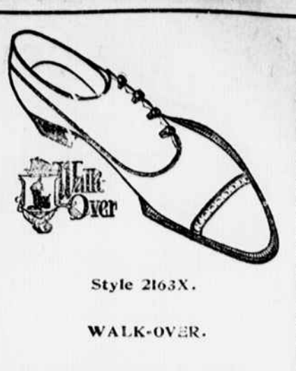
Style 2163X. WALK-OVER.

THE PARKWAY, Patent Colt, Gun Metal and Russian Calf. A size and width for every foot.