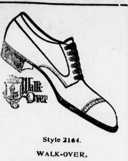
Style 2164. WALK-OVER.

THE NEW BUD. Patent Leather. Gun Metal, Vici Kid and Russian Calf, made in Blucher and Button.