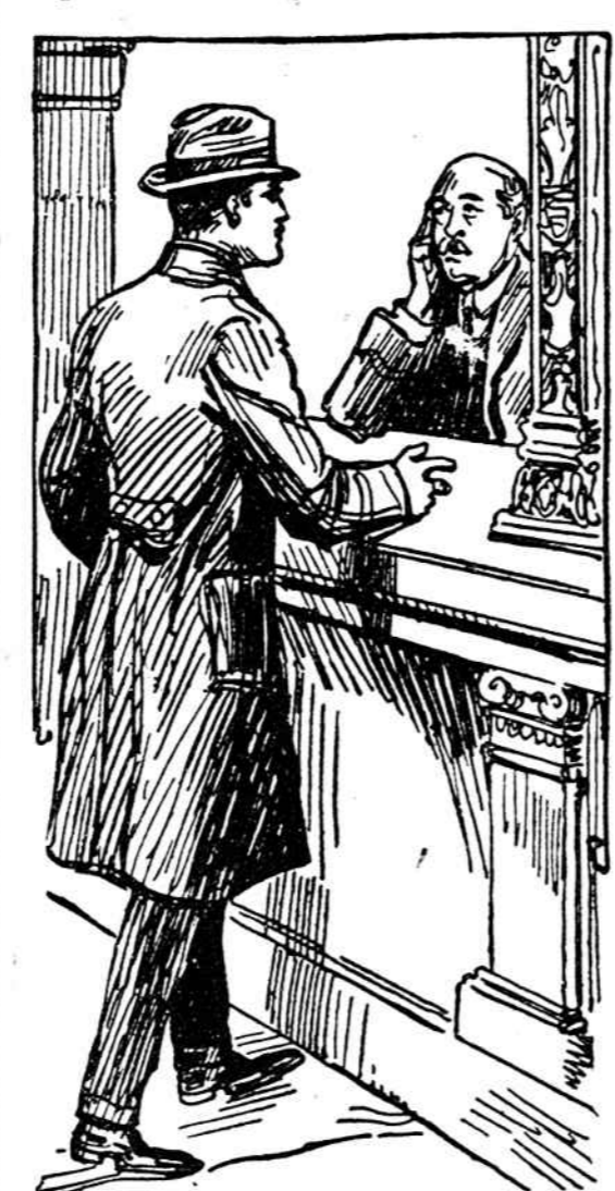
Questioned Him Relative to the Mysterious Box.

As I rested there, sleepless, staring up at the black ceiling, the words of the strange fragment of letter remained vividly before me. Little by little I dug at the truth, coming finally to this conclusion: "108" was, no doubt, the recognized number of some agent who had been dispatched to America on a special errand to the conspirators in this country. He had sailed Saturday, a month ago, or more, and must have long since arrived at some port, bringing with him instructions not to be trusted to the mail, and sufficient money, in form of letter of credit, with which to finance whatever nefarious scheme of revolution might be contemplated. This money