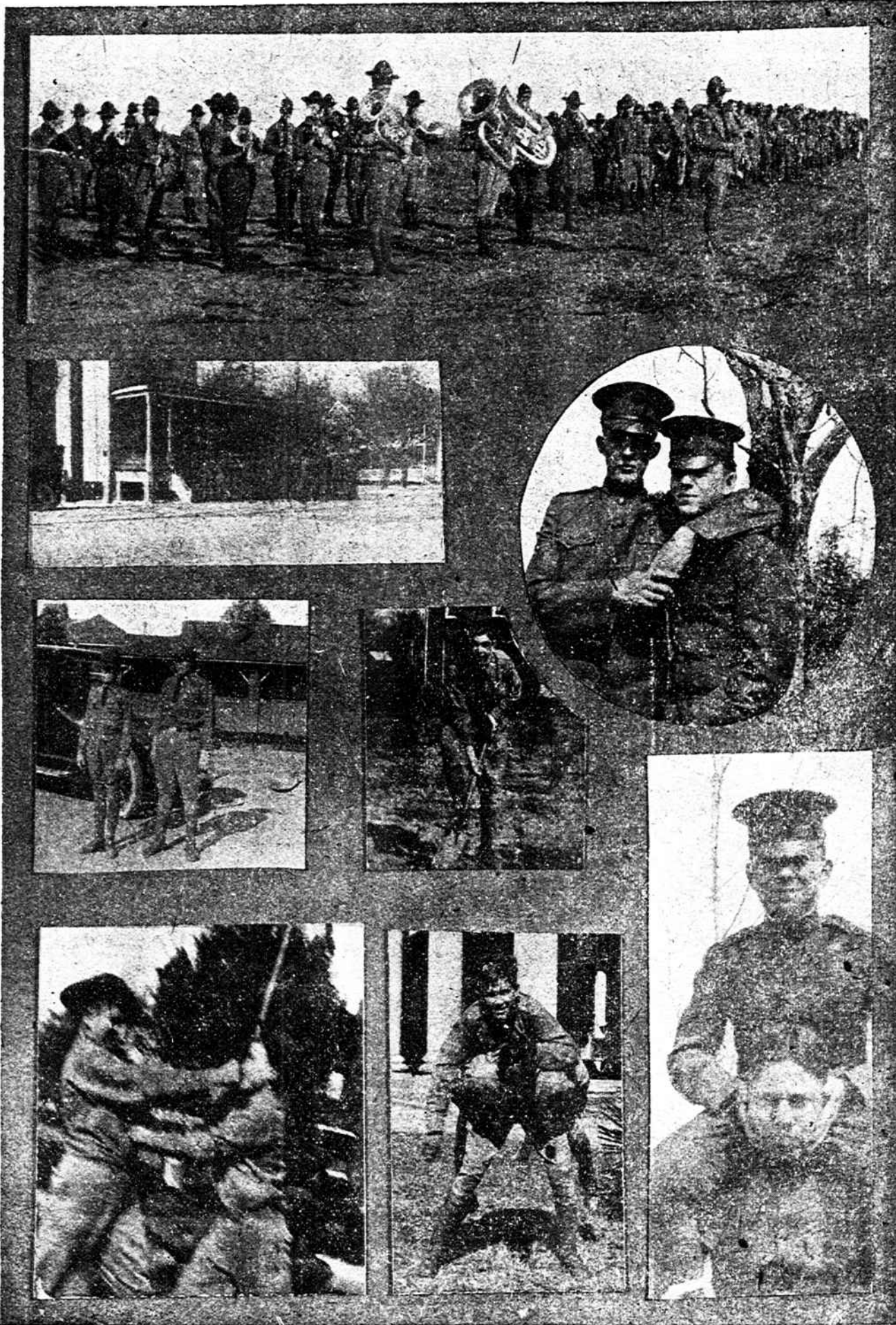
CADET ACTIVITIES, CARLISLE SCHOOL.

Spartanburg, May 28.—With his heart on right side, his liver on his left side, and various other internal organs situated in positions of the anatomy just opposite to those ordinarily accepted as the proper locations for such organs, a prominent person of Spartanburg county is causing local physicians and surgeons much thought. The discovery that this person possesses an anatomy seldom encountered by men of the medical world was made this week when he visited the office of a Spartanburg physician for the purpose of undergoing examination. The person had experienced much pain in his side and fearing he was about to be stricken with appendicitis he visited the physician's office.