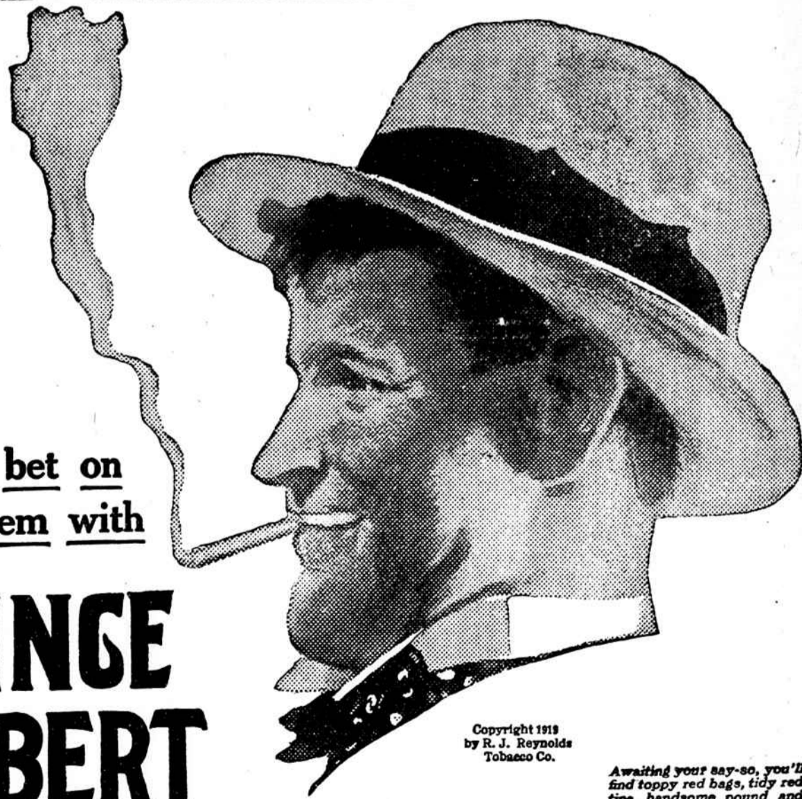
Copyright 1919 by R. J. Reynolds Tobacco Co.

You'll like Prince Albert in a jimmy pipe as much as you do in a home-rolled cigarette, too! Bite and parch are cut out by our exclusive patented process. You know P. A. is the tobacco that has led three men to smoke pipes where one was smoked before. Yes sir, Prince Albert blazed the way. And, me-o-my, what a wad of smokesport will ripple your way every time you fill up!