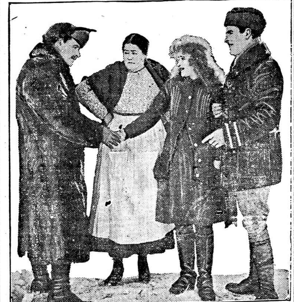
The Bold Eyes of Morgan Devoured Her.