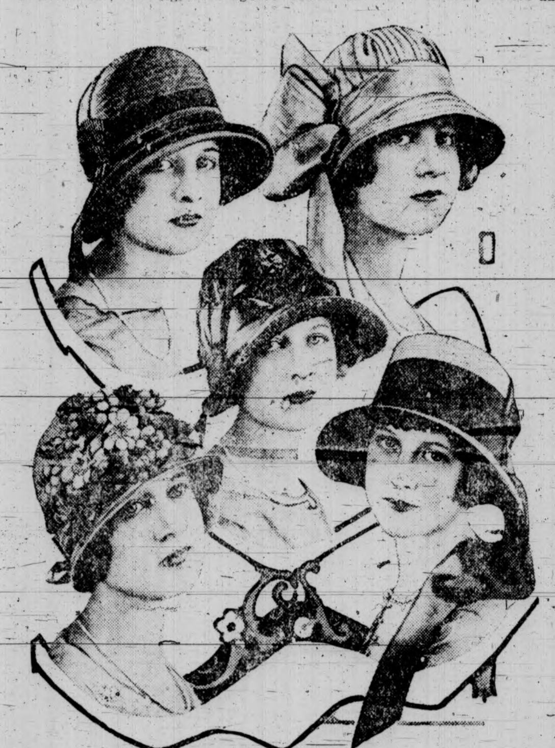
Hats for Subdebs and Flappers.

Printed silks, showing black figures same color trims it. At the right a hat of taffeta silk, in a pretty poke shape, has a sash of wide moire ribbon, with bow posed at the right side and hanging ends. This model is pretty in any of the approved colors. Millinery patent leather, or silk, will serve for the hat at the center of the group with underbrim facing of tagal braid. Heavy silk is used for the buttonhole stitching about the brim edge and bright red or pure white are effective on hats of black patent leather. There is a collar and bow of ribbon in the color of the stitching and a flower motif applied on the front crown. Grapes, flowers and foliage trim the milan shape at the lower-left. Milans are shown in many colors and