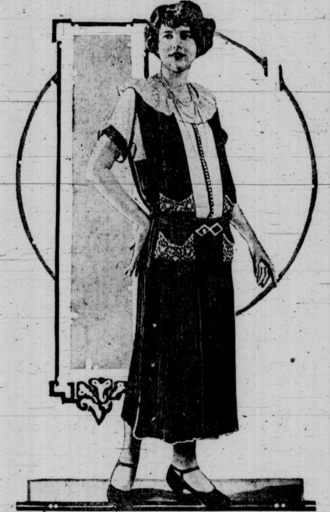
Afternoon Gown of Crepe de Chine.

The handsome afternoon frock shown here is of black crepe de chine with plaited skirt split a little way up at each side and finished with a piping of white crepe de chine. A box-