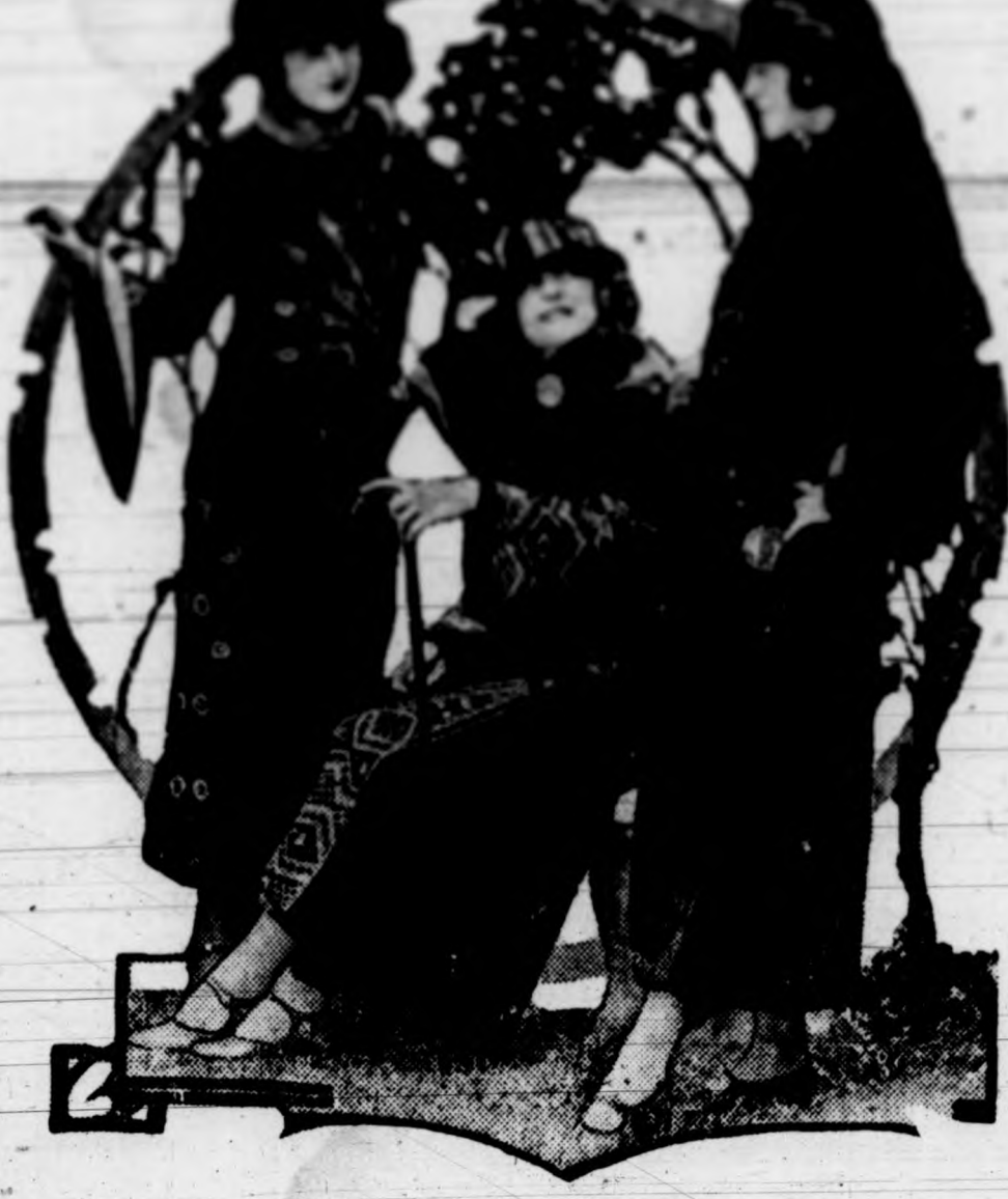
Ornate Trimmings the Rage

respectable." "Are spats a sign of respectability?" asked Mr. Lankester, the magistrate. "They are often used to conceal old