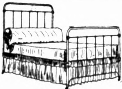
Beds from $3.50 to $25.00