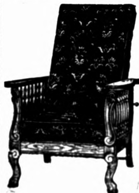
Chairs from 50c to $25

Bed-room Suits from $17.50 to $25.00 Parlor Suits from $25 to $35.00 Living Tables from $8 to $15.00 Linenports from $15 to $30.00 Bed Lounges from $12.50 to $17.50 Leather Couches from $10.50 to $25.00 Mattresses from $2.50 to $10.00 Bed Springs from $2 to $7.50 Kitchen Safes from $1.50 to $10.00 Trunks from $2.50 to $25.00