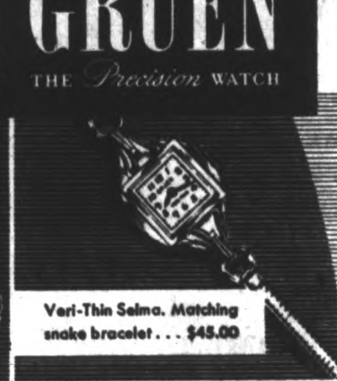
Veri-Thin Salmo. Matching snake bracelet. . . $45.00