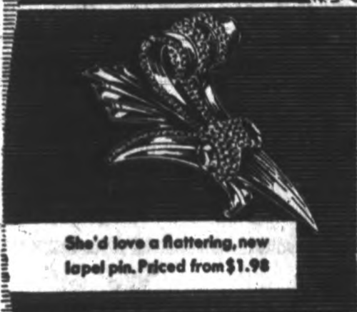
She'd love a flattering, new lapel pin. Priced from $1.98