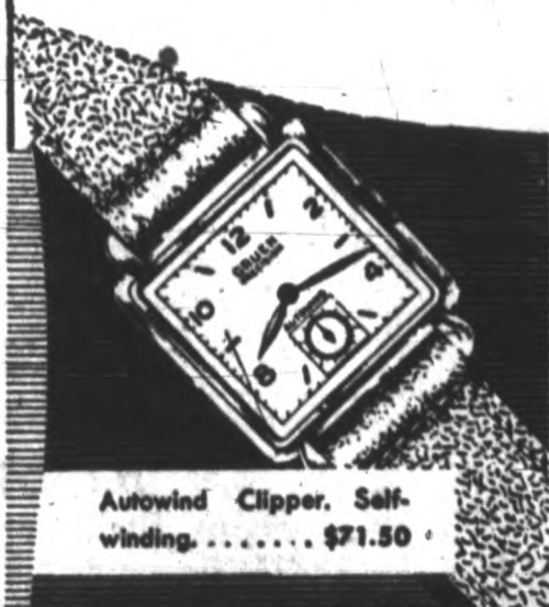
Autowind Clipper. Self-winding. . . . . $71.50