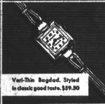
Veri-Thin Bogdad. Styled in classic good taste. $59.90