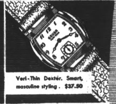
Veri-Thin Dextré. Smart, masculine styling. . . $37.90