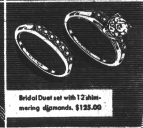
Bridal Dust set with 12 shimmering diamonds. $125.00