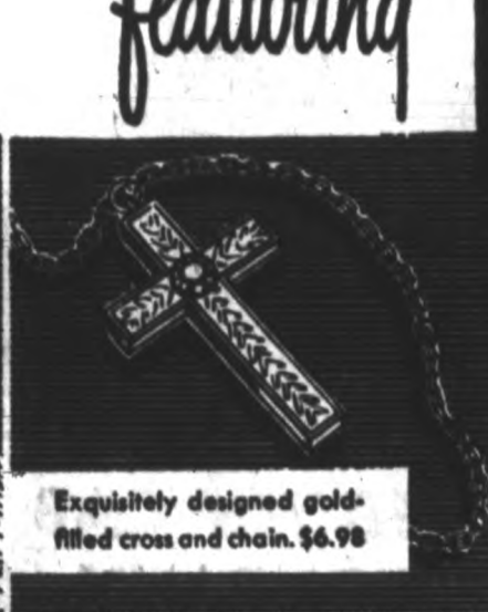
Exquisitely designed gold-filled cross and chain. $6.98