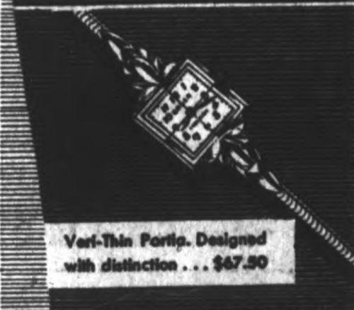
Veri-Thin Parip. Designed with distinction. . . $67.90