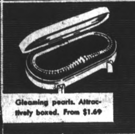
Gleaning pearls. Attractively boxed. From $1.69