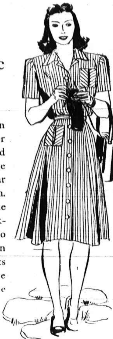
CAMDEN, S. C.

EXCLUSIVE WITH RAZOOK'S IMPORTERS, Inc. KIRKWOOD HOTEL