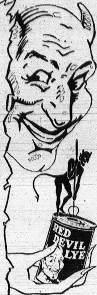
Handy sifter-top can keeps the powdered Lye at its full concentrated strength, ready for use without any waste. Look for the Red Devil's head on the label and get a can today.

Made By Wm. Schield Manufacturing Co., St. Louis, Mo.