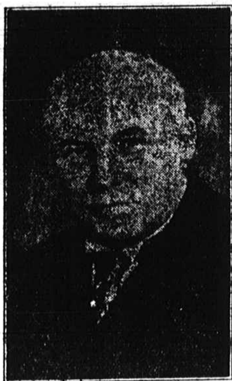
FRANKLIN K. LANE.

In a letter to Commander Evangeline Booth, Mr. Lane declared that sympathy for the suffering people of other lands must not cause America to neglect her own poor and unfortunate classes.