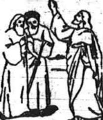
"Thy Kingdom come."

(6) The Bible assures us that there is an Evil One, and that he has great power and influence amongst men, that he is "the prince of the power of the air," and "the god of this Age." How appropriate that we request the Lord not to abandon us to the Devil's wiles. The words, "For Thine is the Kingdom and the power and the glory forever, Amen," are not found in the oldest Greek manuscripts, and are therefore properly omitted in the Revised Version. We await the overthrow of Satan's Empire, and the binding of the Adversary for a thousand years, and the ushering in of the Divine Kingdom and power and glory, forever.