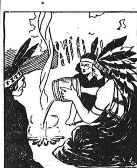
Indians' Infallible Test.

It was by this simple experiment that the term "firewater" became a