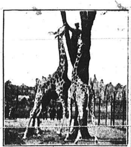
Feeding the Giraffes.

New York.—The giraffe in captivity is one of the most delicate of animals and requires the closest of care on the part of the keepers. Aside from necessity for cleanliness in their housing, the most important feature in caring for them is the selection of the