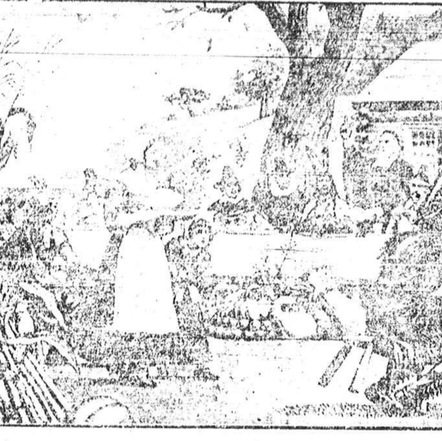
THE FIRST THANKSGIVING DINNER.

UNCLE JERRY WILSON opened the gate and the milk cows straggled out into the lane.