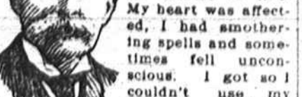
THE KIDNEY SECRETIONS WERE BADLY DISORDERED. I WAS COMPLETELY WORN OUT AND DISCOURAGED WHEN I BEGAN USING DOAN'S KIDNEY PILLS, BUT THEY WENT RIGHT TO THE CAUSE OF THE TROUBLE AND DID THEIR WORK WELL. I HAVE BEEN FEELING WELL EVER SINCE.