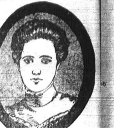
This woman says Lydia E. Pinkham's Vegetable Compound saved her life. Read her letter.