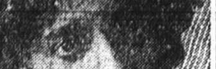
THE KIDNEY SECRETIONS WERE BADLY DISORDERED. I WAS COMPLETELY WORN OUT AND DISCOURAGED WHEN I BEGAN USING DOAN'S KIDNEY PILLS, BUT THEY WENT RIGHT TO THE CAUSE OF THE TROUBLE AND DID THEIR WORK WELL. I HAVE BEEN FEELING WELL EVER SINCE.