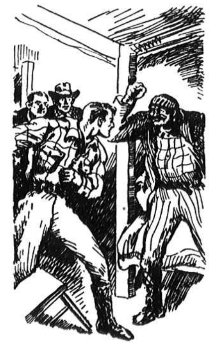
The Bull Gave Up Trying to Close.

He drove out with both fists, heedless of defense, blind to Duval's counter offensive. He shouted as he struck. He used a knee to break another hold, he bit when Duval tried to throttle him with the grip of both hands, He danced as the Bull sought to trample