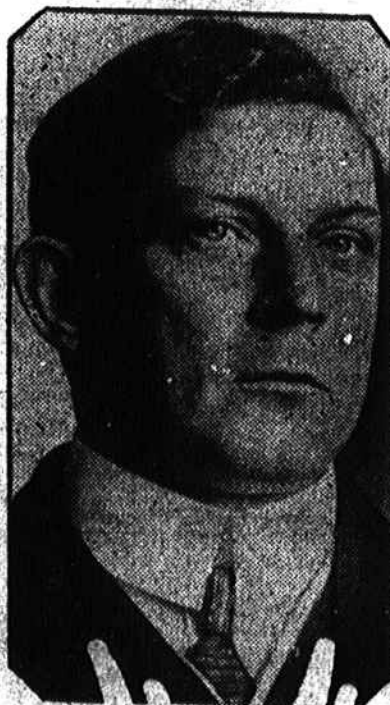
Swagar Sherley, the Kentucky congressman and wartime head of the house appropriations committee, who was commissioned by President-Elect Roosevelt to supervise the formation of plans for a complete reorganization of the entire federal government. Sherley is assisted in the gigantic task by a number of the country's leading economists and government experts.