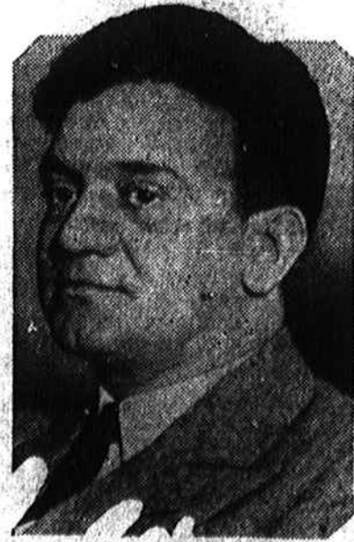
Ferdinand Pecora of New York, who was appointed counsel to the United States senate subcommittee on banking and currency, to conduct the stock market inquiry. The investigation will touch the issue and distribution of securities and will include a survey of the responsibility to the public of corporation directors.

Insects Transmit Disease There are more than twenty diseases transmitted to man by insects.