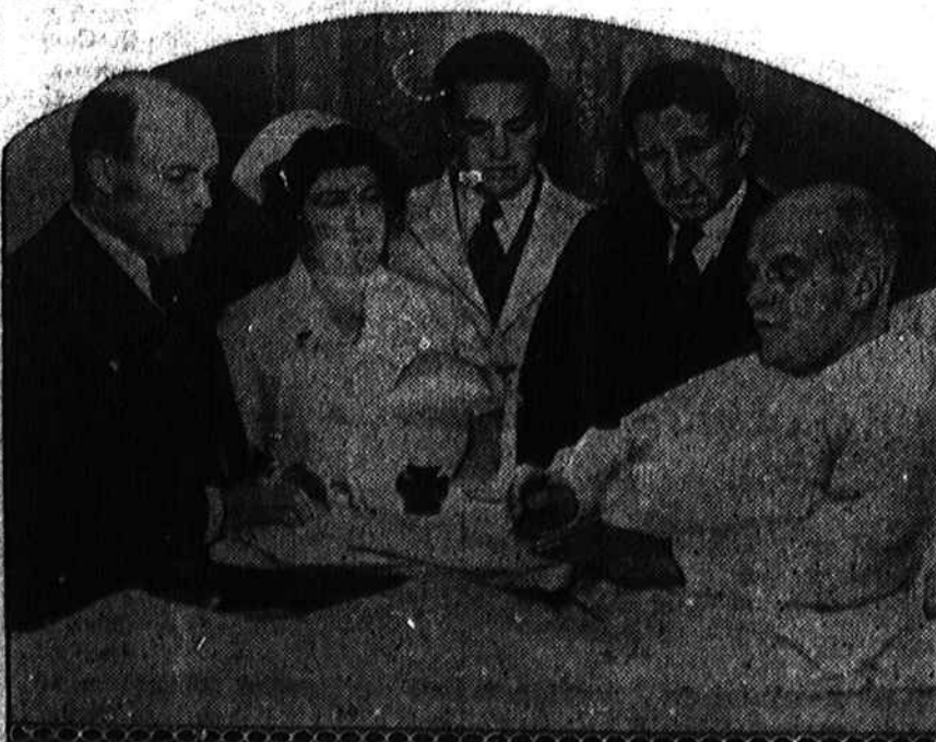
Gov. James Rolph, Jr., of California, is here shown in a San Francisco hospital signing the enabling act to start work on the San Francisco bay bridge. While he was recovering from an attack of influenza the state grange circulated petitions for his recall on the ground of "incompetency."