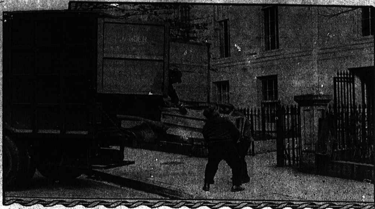
White House workmen have started the huge task of removing all of the private property of President Hoover from the executive office in the White House. The photograph shows them loading a truck with crates to be shipped to the President's home in California.