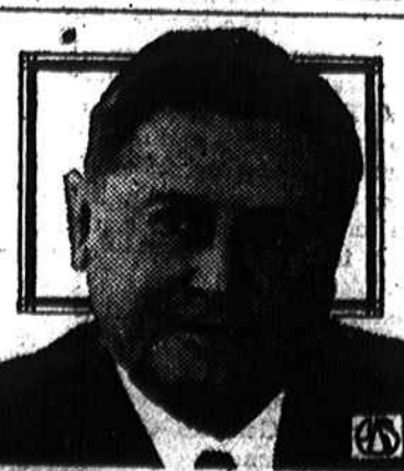
William Wrigley, Jr., Chicago chewing gum magnate, owner of the Chicago Cubs, Catalina Island, and many millions, died in Phoenix. He established his business in forty countries.