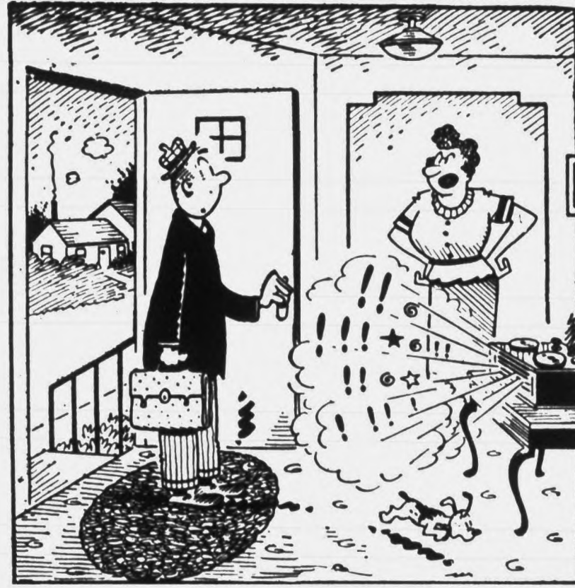
"Remember walking out on me this morning when I was lecturing you? Well, here's a tape recording of the balance of it!"