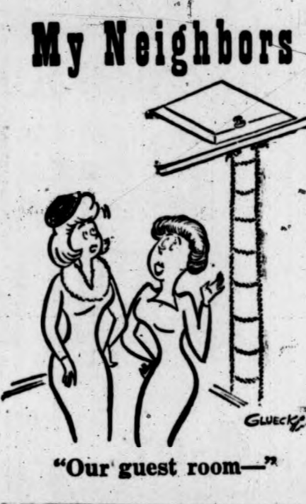
"Our guest room—"