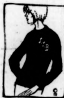
Table of Sweaters REDUCED