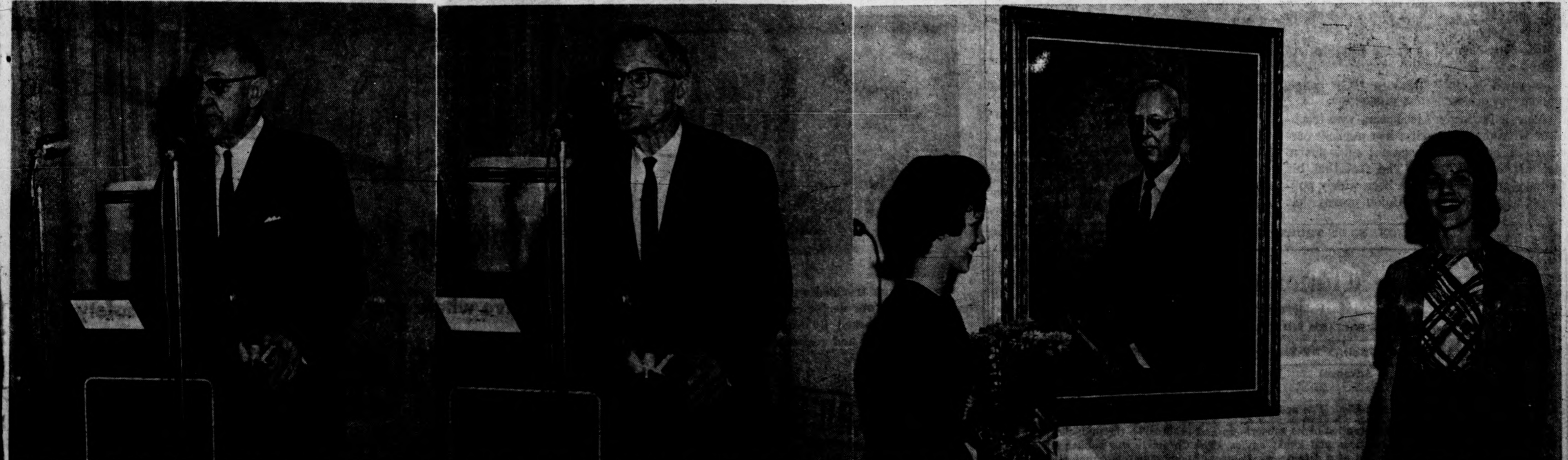
Scenes at Dedication Ceremonies Sunday Afternoon of New $1,000,000 Hospital at Whitten Village