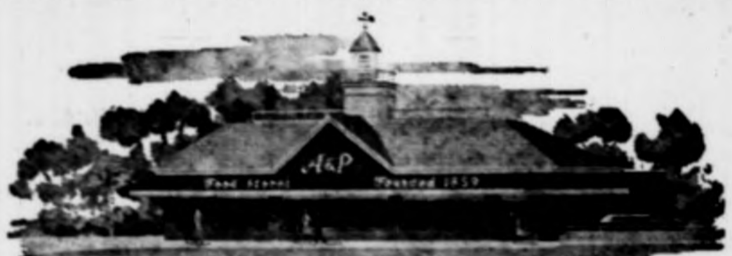
The Centennial A&P Super Market... there will be more of them!