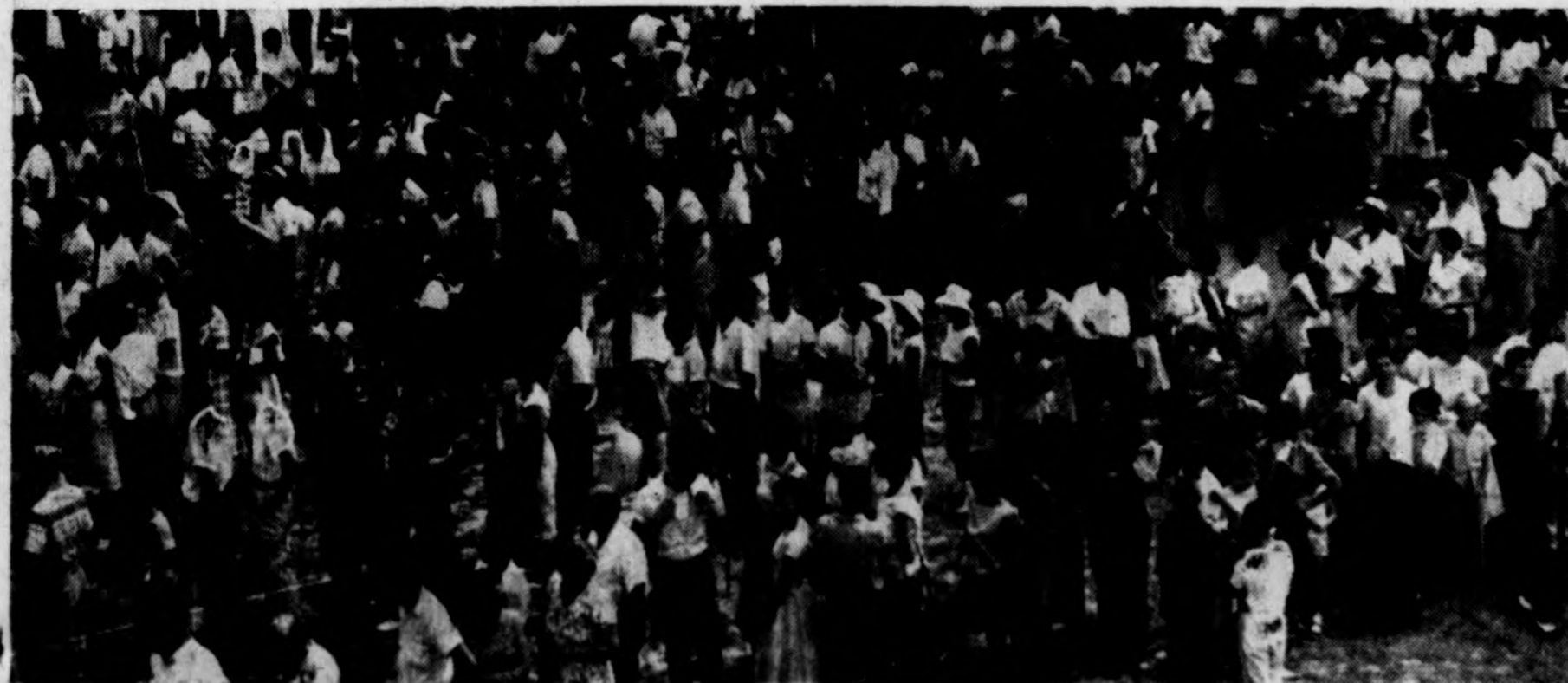
These scenes show activities at the Labor Day celebration Monday when employees and families of Joanna Cotton Mills enjoyed a barbecue dinner and a day-long program of entertainment and events arranged by the management. At the left are shown several lines formed for the dinner.