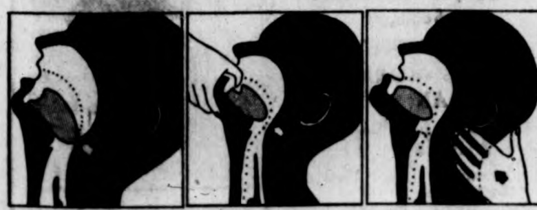
TO KEEP WINDPIPE CLEAR . . . WITH LOWER JAW in normal position, tongue may block the windtipe and prevent air from entering lungs (left). Two ways to prevent this are-Center: insert left thumb in mouth, grosp lower jaw and pull orward and upward. Right: push jew forward by pressing at the jewe. This method is of special use with infants since the thumb in the