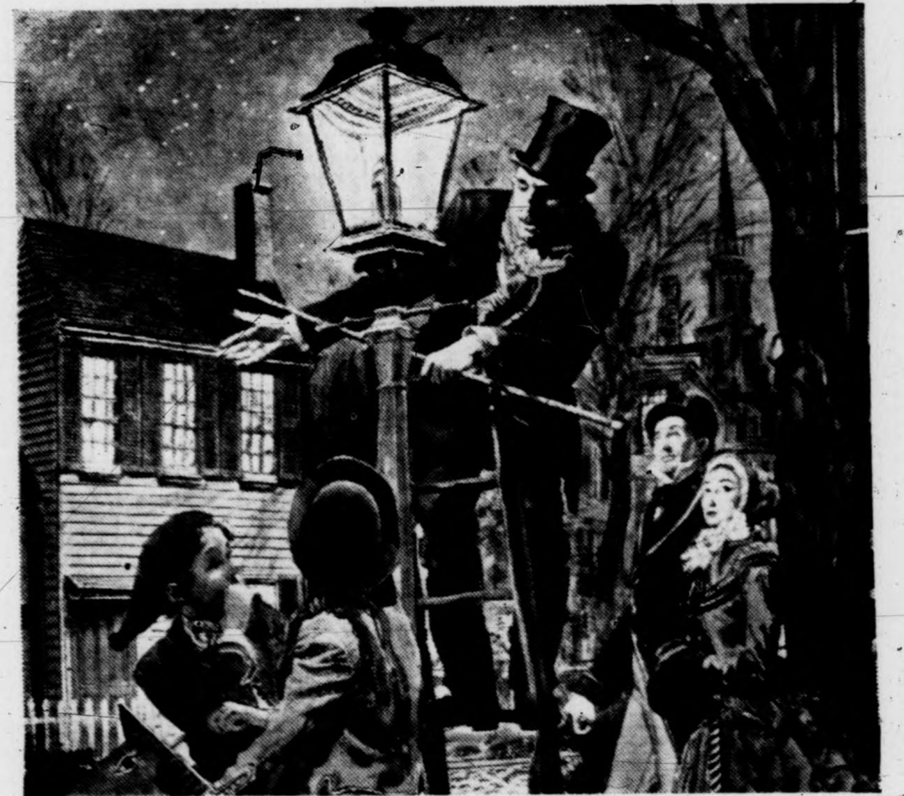
1831 The first home loan by a Savings and Loan Association was granted to a lamplighter in Frankford, Pennsylvania, now part of Philadelphia.

Last year, Insured Savings and Loan Associations like ours, made home loans to more American families than did all other financial institutions combined... well over 1 million loans totaling $15 billion. Whether you are opening a savings account for a down payment on a home of your own or want financing to buy or build your home, we suggest you see us first.