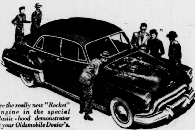
See the really new "Rocket" Engine in the special plastic-hood demonstrator at your Oldsmobile Dealer's.