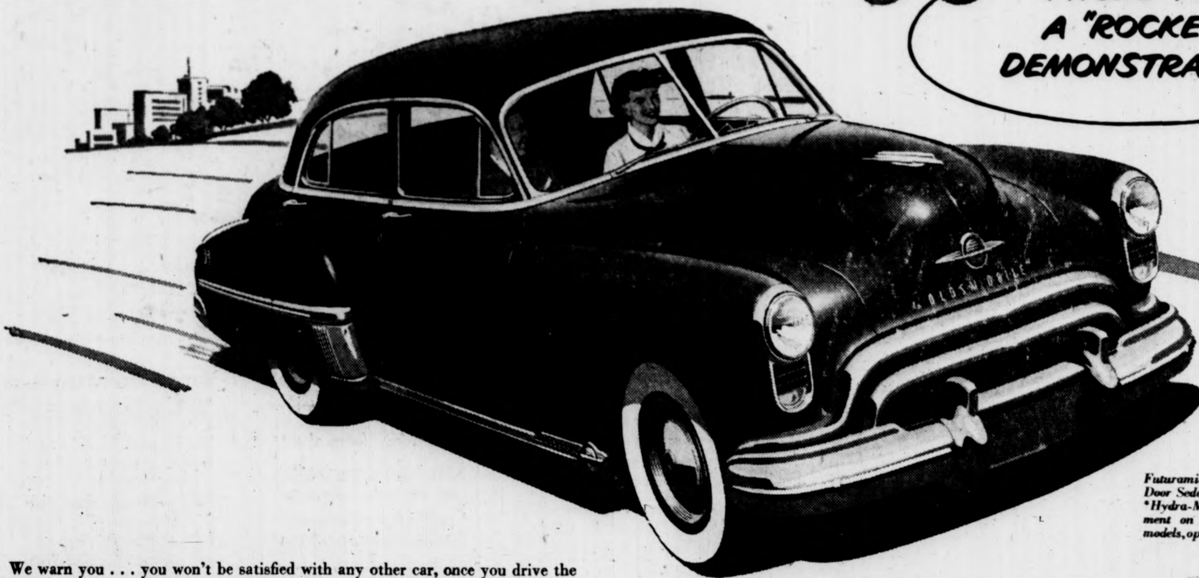
Futuramic Oldsmobile "88" Four-Door Sedan with "Rocket" Engine. "Hydra-Matic Drive" standard equipment on Series "98" and "88" models, optional at extra cost on "76."

We warn you . . . you won't be satisfied with any other car, once you drive the "88." For this is a "Rocket" Engine car, and your first minutes at its wheel will give you a completely new point of view about motoring! Here's eager power that makes traffic driving easy. Here's effortless power that's-tuned to the open road. Here's high-compression power that costs less, not more, to command! And it's paired with the new ease and safety of Hydra-Matic Drive*. All this plus Futuramic Styling in compact yet spacious Bodies by Fisher! But you've got to drive it to believe it. Make your date with the "88"! Call your Oldsmobile dealer!