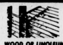
WOOD OR LINOLEUM