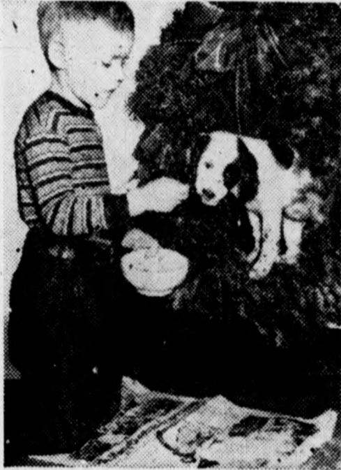
PRESENT . . . This puppy is as happy as his master. Experts say that a pet is an ideal gift for children.