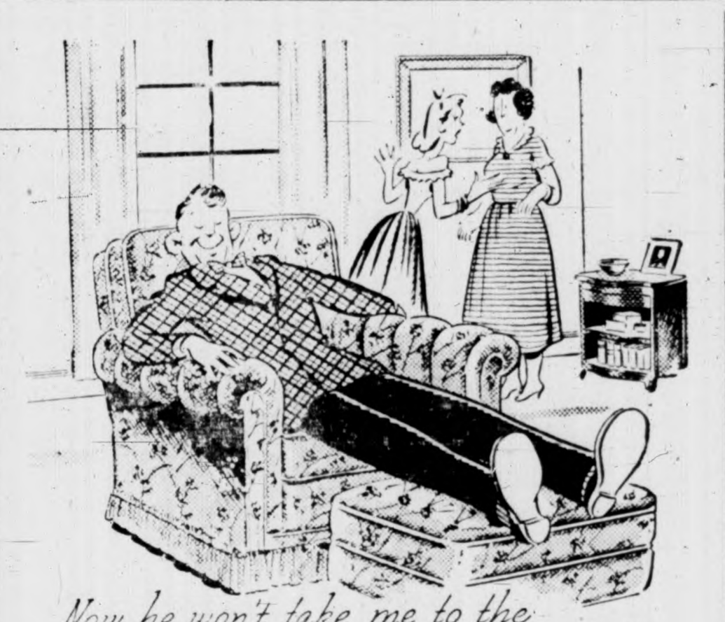
Now he won't take me to the dance, Mama. I told you to hide the new CHAIR we bought from