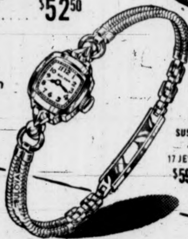
SUSAN 17 JEWELS $59.50

For every important occasion give a really fine gift, a Bulova Watch —