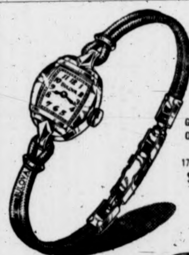
GODDESS OF TIME 17 JEWELS $33.75