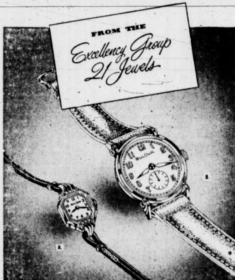
A. HER EXCELLENCY "A" 21 JEWELS $49.50 B. HIS EXCELLENCY "AA" 21 JEWELS $52.50