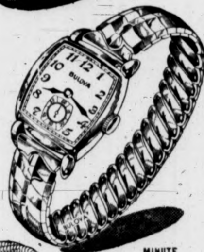
MINUTE MAN 17 JEWELS expansion bracelet $49.50