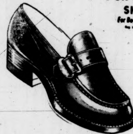
Red Moccasin Sizes 12 to 3 $4.95