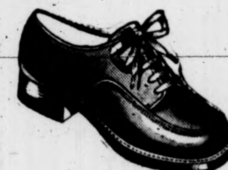
Tan Oxford Sizes 8 1/2 to 12 $4.95 Sizes 12 1/2 to 3 $5.50