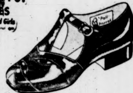
White Calf or Black Patent Sizes 8 1/2 to 12 $5.50 Sizes 12 1/2 to 3 $5.95