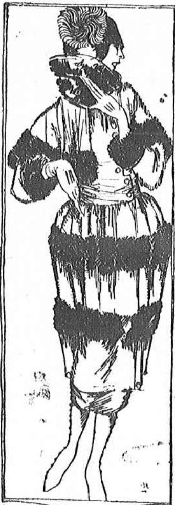
Furs at Half Price