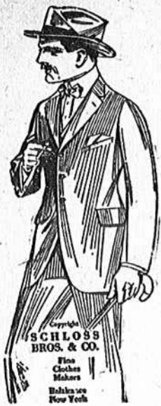
The Stein-Block Clothes