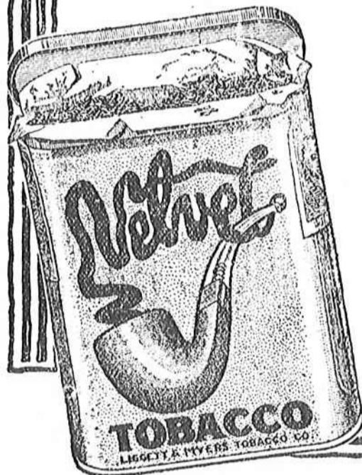
Roll a VELVET Cigarette

All kinds of things are packed in tobacco tins, but your good neighbor will tell you "Velvet is the real pipe tobacco." Prove it for yourself.