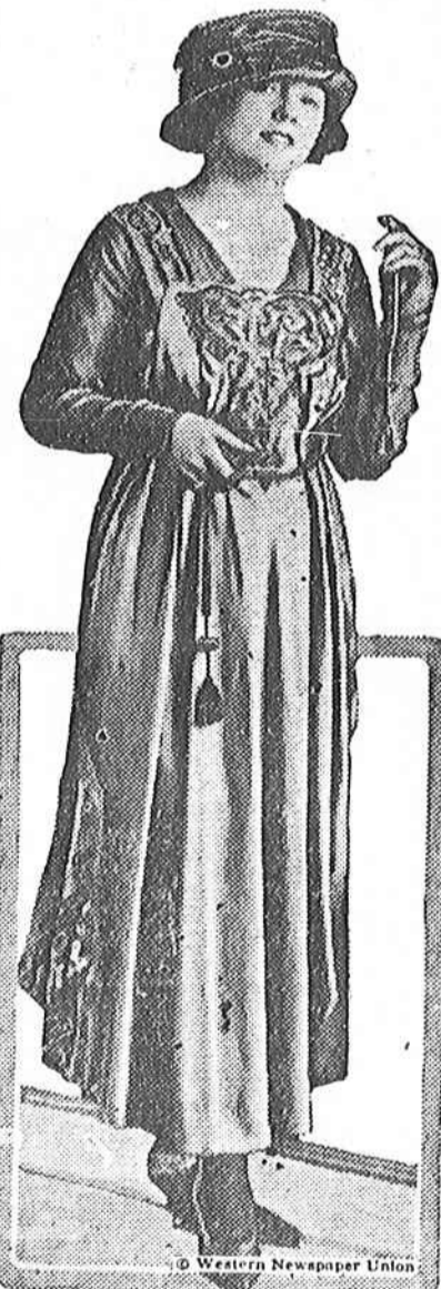
The model shown above is a gown of love color charmeuse, most interestingly hand-painted and embroidered.