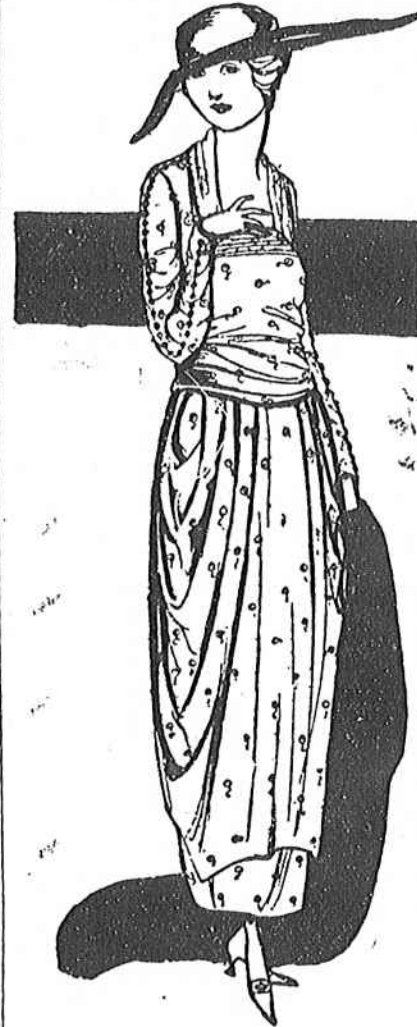
Frock of Taffeta or Printed Foulard.

The little frock shown in the sketch is offered as an early spring model, but it is not sufficiently extreme to demand classification with any particu-