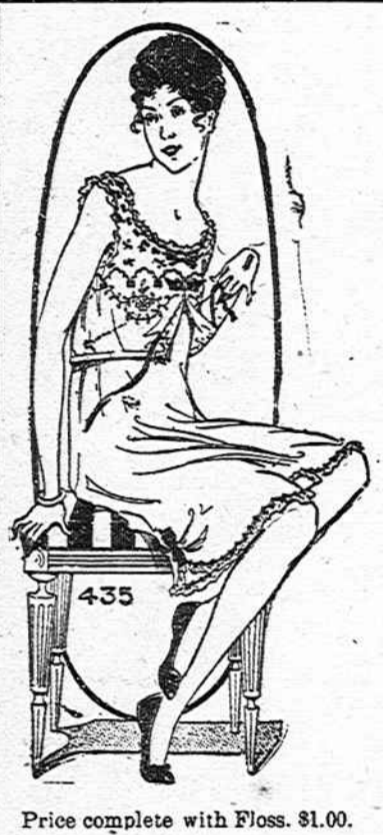
Price complete with Floss, $1.00.