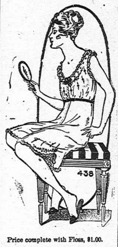
Price complete with Floss, $1.00.

All numbers Royal Society Crochet Cotton, 10c. Ball.