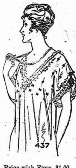
Price with Floss, $1.00.