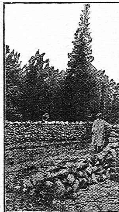
A Durable Stone Culvert.

There is a growing demand for more and better road making during the autumn months. In many localities the roads become filled with deep ruts and the wheel tracks so depressed during the summer that they collect rains which soon wash them into gutters which soon ruin the roads for heavy loads and comfortable travel. There is no reason why a portion of