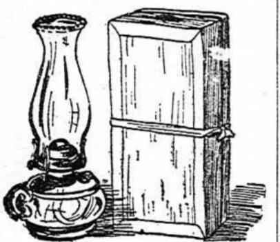
Home-Made Egg Tester.

A fresh egg held at the hole opposite the blaze of the lamp will show perfectly clear through the shell. A stale or bad egg will show dark spots. This egg tester may be used with excellent results in determining whether eggs are fertile or infertile. Many eggs that are laid in late winter and early spring are infertile. For this reason it is advisable when setting time comes, to set several hens at the same time. After the eggs have been under the hen for seven days they should be tested to see whether they are fertile or infertile. Infertile eggs should be removed and used at home in cooking, for they are just as good as others, and the fertile eggs