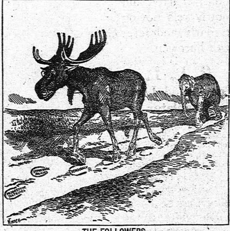
THE FOLLOWERS. —Winner in the Pittsburg Post.

"The choice which the voters have to make is simply this: Shall they have a government free to serve them, free to serve ALL of them, or shall they continue to have a government which dispenses SPECIAL favors and which is always controlled by those to whom the SPECIAL favors are dispensed?" WOODROW WILSON.