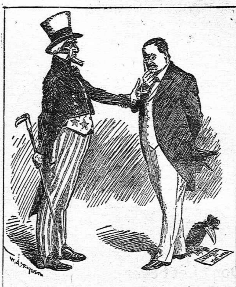
Uncle Sam—"Honestly, What Are You Running for, the Presidency or for Revenge?" —From the New York Herald.

Bucklen's Arnica Salve The Best Salve in the World.