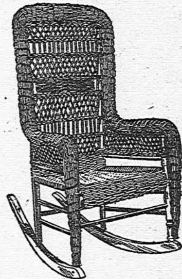
Chairs, all prices.