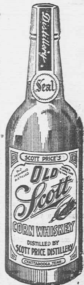
A bottle of this fine old corn free.

Try the free quart. Drink it—every drop. If not entirely pleased, satisfied and delighted, return the other eight quarts, A bottle of this fine old corn free.