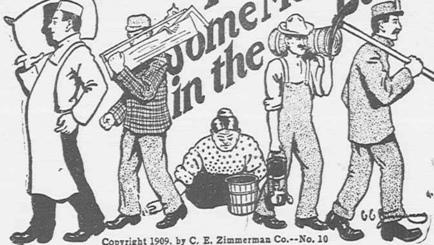
Copyright 1909, by C. E. Zimmerman Co.--No. 10

No Matter What You DO put some of your Money in the Bank