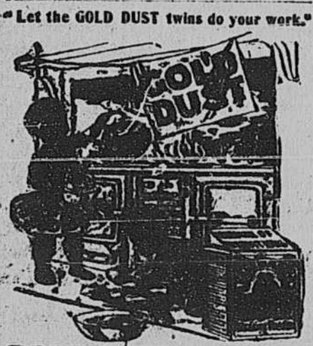
GOLD DUST will clean anything about the house at half the cost of soap and with half the labor. "Housework is hard work without Gold Dust." THE N. K. FAIRBANK COMPANY, Chicago.

—Call a man a donkey and he is apt to kick.